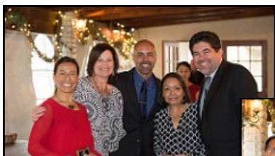
Perris High School Staff