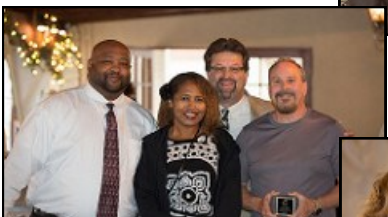
Perris Lake High School Staff