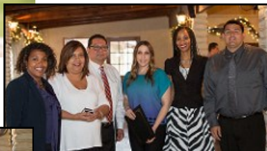
Pinacate Middle School Staff