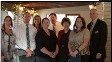
Paloma Valley High School Staff