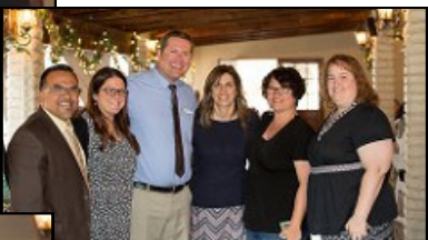
Heritage High School Staff