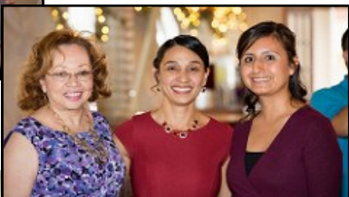
The Academy Staff