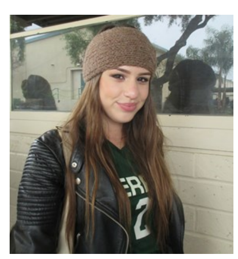
"How the Grinch Stole Christmas" because it teaches a valuable lesson.