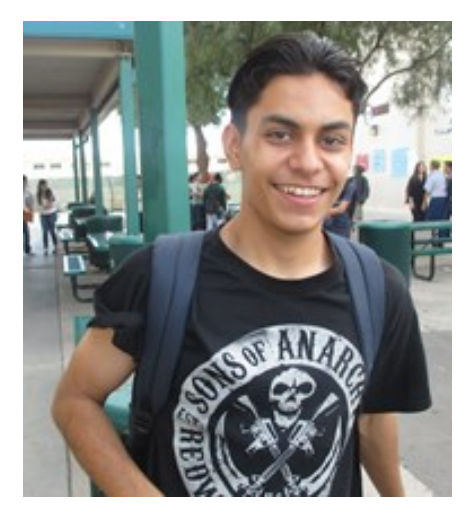
"The Nightmare Before Christmas"